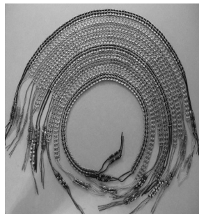
Belts in multiple sizes and colors which are for sale to support Iraqi troops