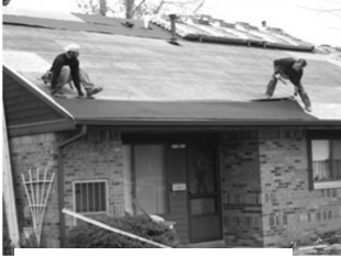
Roofing renovation at Senior Housing