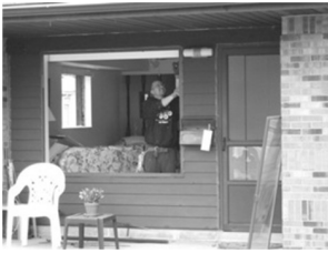
New windows at Senior Housing