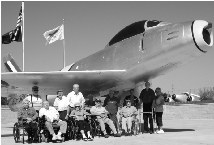
Large group enjoys visiting Selfridge Air National Guard

Residents were actually able to board different aircraft and sit in pilot seats and tour larger airplanes.